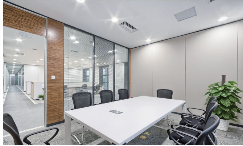
LED US Pro Tunable Downlight