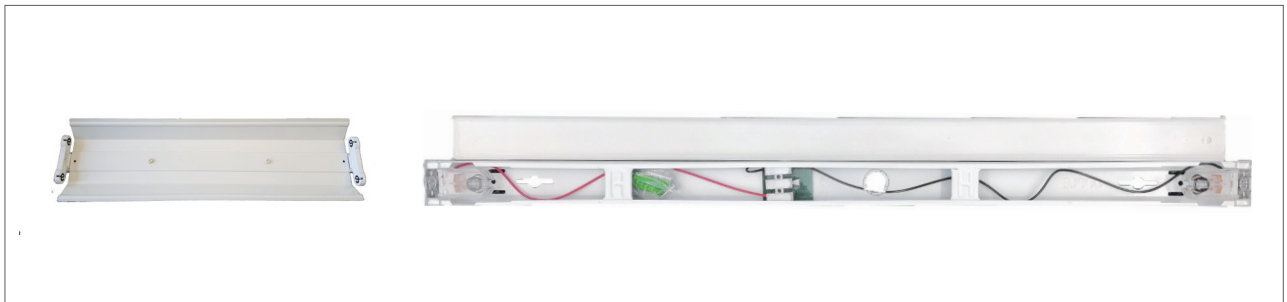
LED Utility T8 Empty Batten (Match with double-end T8 Tube)